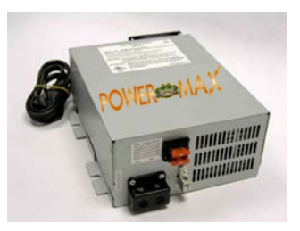
AC to DC Converter/Charger